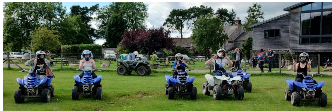
Above: Rookin House Activity Day - Quad Biking. Below: (L-R) Ice skating at Dumfries Ice Bowl, Carlisle United Football Match, Newcastle University Campus Visit.

Below are some photos of the activities we have provided for young Carers so far this year with more exciting days out planned for this summer. We have also started planning their upcoming Halloween and Christmas parties!